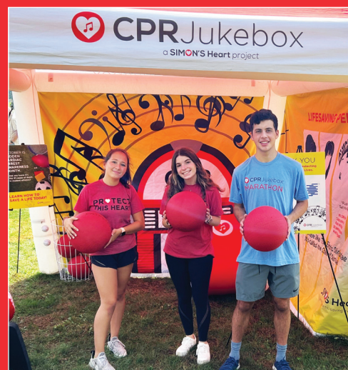
Student Ambassadors volunteering at a CPR Jukebox stop.